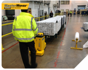
Plastic and Metal Extrusion