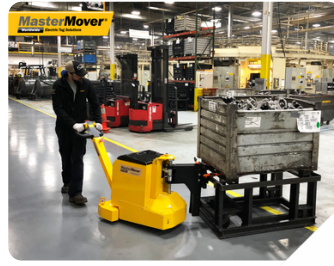
Automotive and Commercial vehicles