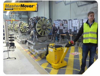
Engine, Pump and Generator