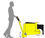
Self-adjusting castor guard for foot protection

See our website for full technical details