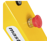
Emergency stop button