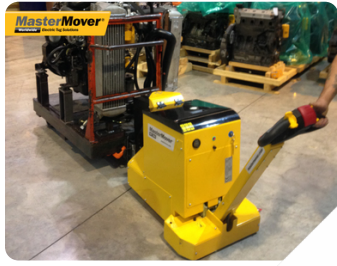
Engine, Pump and Generator

Suitable for use in a wide range of applications and sectors