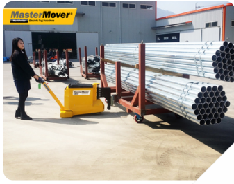
Plastic and Metal Extrusion

Suitable for use in a wide range of applications and sectors