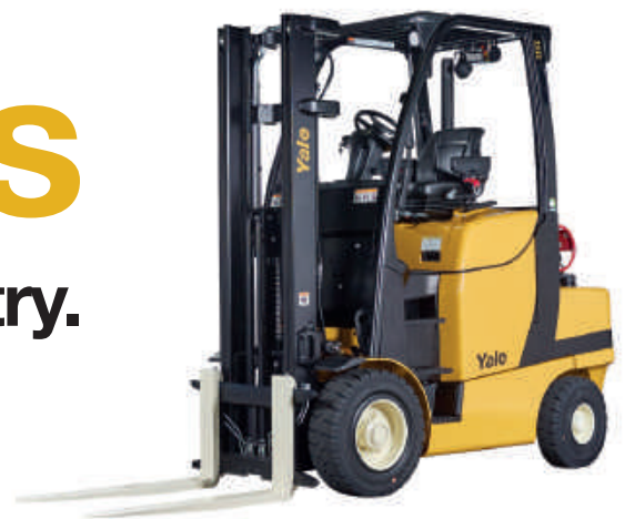
Raised cab for improved visibility.